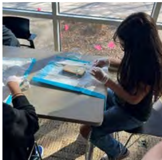
Centered: Students inserting an IV during a "hands-on-healthcare" station at an AHEC school event.